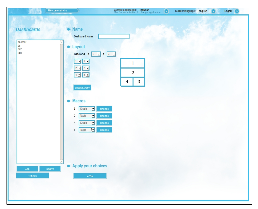
Figure 11.4 Dashboard Definition.

The CHECK LAYOUT button is used to preview the layout definition. For each section of the dashboard a macro, must be associated.